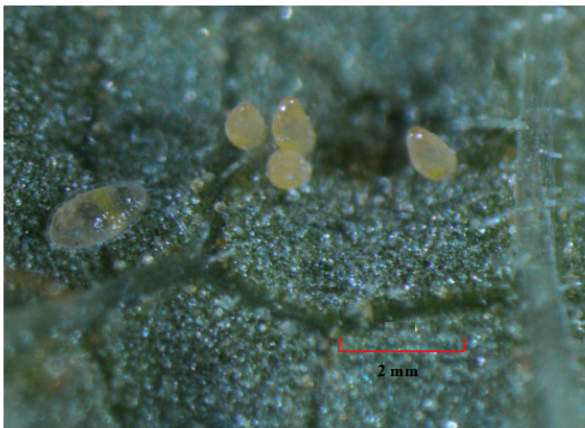
Figure 2. Bemisia tabaci eggs and first instar nymph on the underside of a snap bean leaf under microscope with 40× magnification (Li et al., unpublished).

The developmental time of B. tabaci , from egg to adult, is 14 to 105 days, but varies depending on temperature and host plant [43,44,47–49]. For instance, at 20–32 °C, development time ranged from 36.0 to 14.6 days on cantaloupe ( Cucumis melo L. var. cantalupensis ) and 37.9 to 16.3 days on cotton ( Gossypium hirsutum L.) [47]. Several studies on different crops have reported an optimal temperature range for B. tabaci growth as 20–33 °C [43,48].